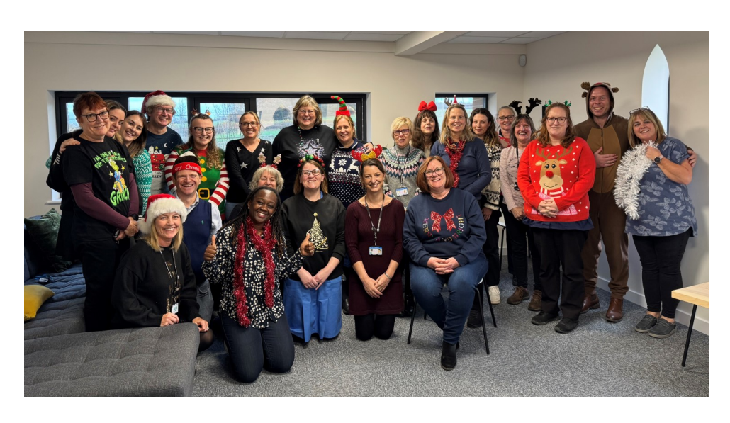
The staff at Puddletown Surgery enjoying some Christmas merriment!

The Doctors, Nurses and all the team would like to wish everyone a Very Merry Christmas and a Happy New Year