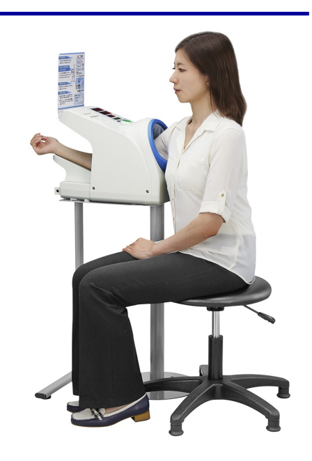
Waiting Room Blood Pressure Monitor

The PPG is a voice for patients and hope they empower patients to say something. Currently the group aims to keep the committee membership to twenty people but has a wider forum of volunteers which they would like to expand. The group also would like to have some younger representation, not necessarily to come to the meetings but to receive communications and feedback by email. If you are interested please email the PPG.